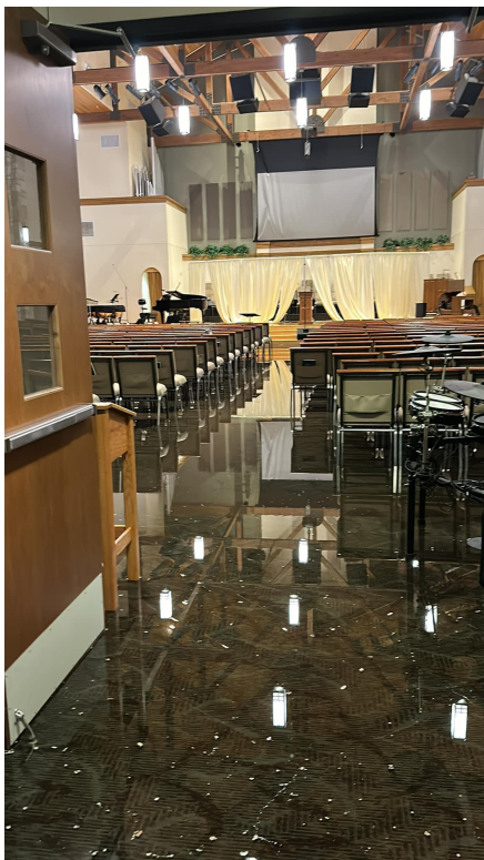
First Baptist Church San Marcos sanctuary, flooded by May 9 storms.

Clint Followell, the church's minister of students, reported the damage to the building in a social media post.