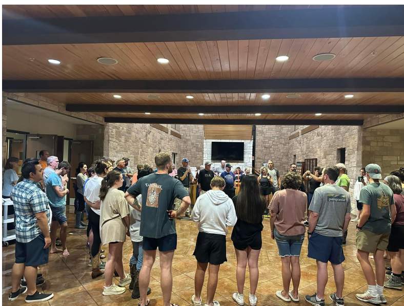
First Baptist Church San Marcos flood clean-up volunteers.

Friends in the area offered to assist Followell and the church in any way they could.