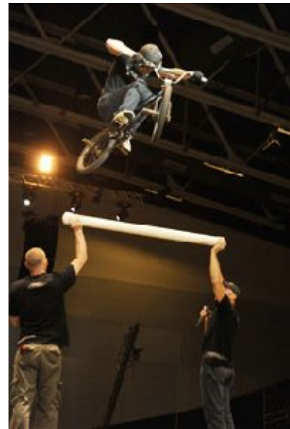
Real Encounter athletes appeared in school assemblies prior to the event to draw unchurched youth.