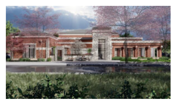
Conceptual drawing of the new Baptist Student Ministry center on the Baylor University campus

The Missions Foundation, the group tasked with coordinating the fundraising effort for the expanding campus ministry, set the total cost of the capital campaign at $7 million. An additional $2 million also is being sought to provide an operating and maintenance endowment for the expanding campus ministry.