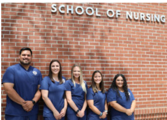
Members of the first graduating