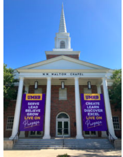
University of Mary Hardin-Baylor