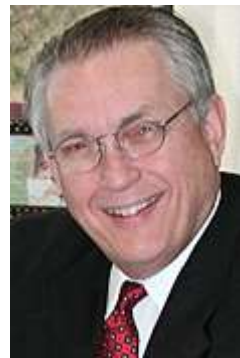
Executive Director BGCT Executive Board

We celebrated his life and the difference he made at his funeral at Park Cities Baptist Church in Dallas Jan. 11.