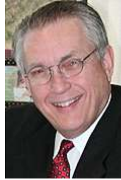
Executive Director BGCT Executive Board

Their assignment—to provide lay-led Bible study—helps the church do all its work more than any other ministry or organization I know.