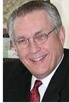
Executive Director BGCT Executive Board

Please pray God will be present at this Missions Exchange and the participants will be truly attentive.