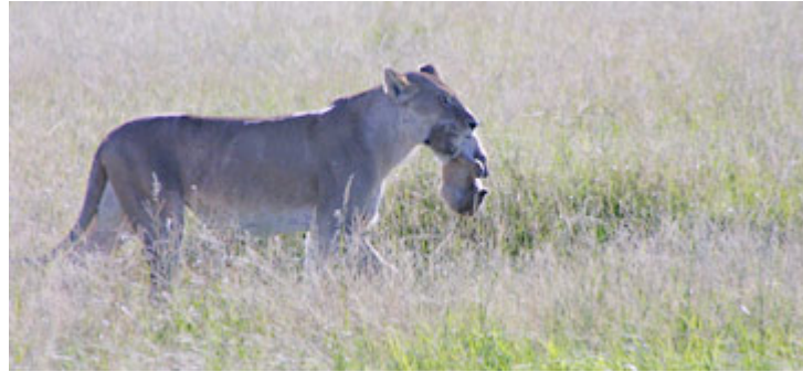
Lioness with cub at the Masaai Mara wildlife preserve.

beauty of God's creation in Africa, and we have grown to love each other. Yesterday morning, we left Nairobi on a single-engine turboprop plane and flew west over the Rift Valley, landing on a dirt airstrip at the Masaai Mara wildlife preserve.