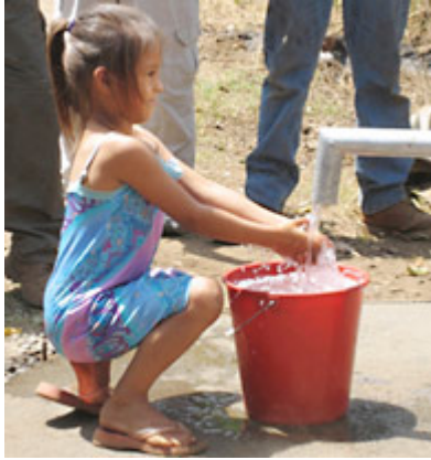
A village girl in Nicaragua enjoys the pure, clean water a new well provides.

The inner-city missions experience, coordinated with the school's Center for Student Missions, included visiting an adult day-care center, leading a museum field trip for schoolchildren from the Third Ward and helping at the Harbor Light shelter sponsored by the Salvation Army. An inner-city church provided lodging for the students during their three days of service with nonprofit organizations in the area.