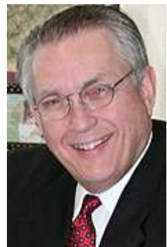
Executive Director BGCT Executive Board

First, I will work to imbed in our organizational culture the gains we have made in serving churches and connecting them to a kingdom-sized vision.