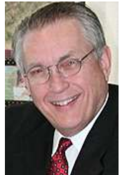
Executive Director BGCT Executive Board

First, I will work to imbed in our organizational culture the gains we have made in serving churches and connecting them to a kingdom-sized vision.