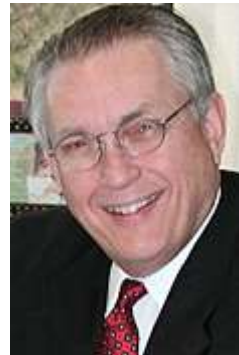
Executive Director BGCT Executive Board

First, I will work to imbed in our organizational culture the gains we have made in serving churches and connecting them to a kingdom-sized vision.