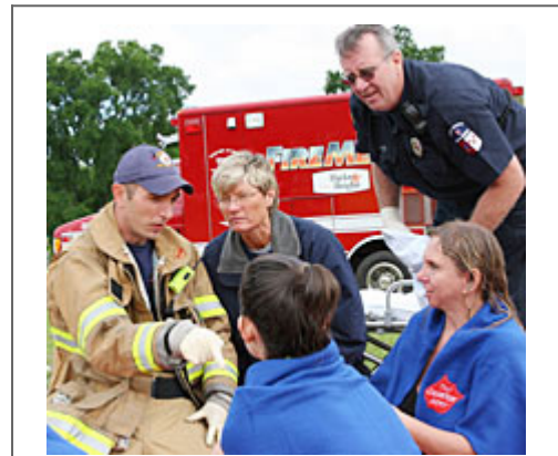
UMHB emergency response personnel confer during emergency preparedness drill.