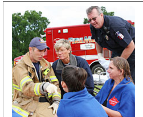
UMHB emergency response personnel confer during emergency preparedness drill.