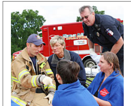
UMHB emergency response personnel confer during emergency preparedness drill.