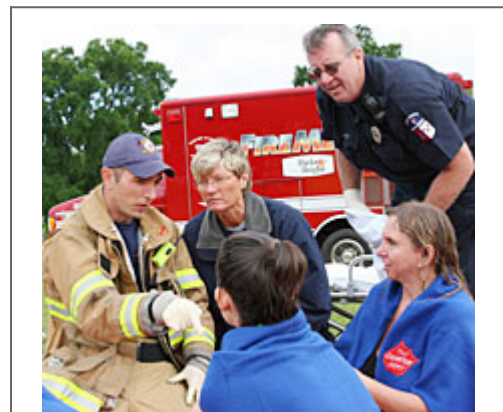
UMHB emergency response personnel confer during emergency preparedness drill.