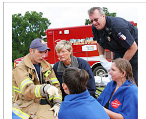
UMHB emergency response personnel confer during emergency preparedness drill.