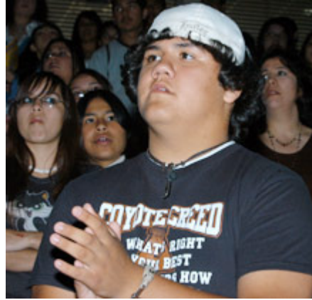
Participants at the Texas Hispanic Youth and Singles Congreso join in worship.