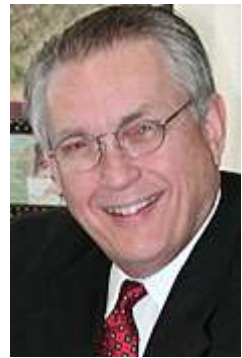
Executive Director BGCT Executive Board

In my book, The Jesus Principle , I address these matters . Here are some principles: