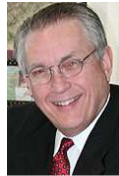
Executive Director BGCT Executive Board

In my book, The Jesus Principle , I address these matters . Here are some principles: