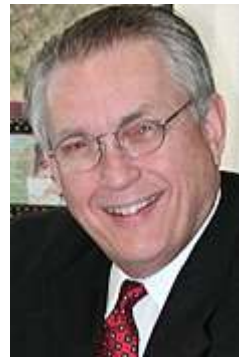
Executive Director BGCT Executive Board

In my book, The Jesus Principle , I address these matters . Here are some principles: