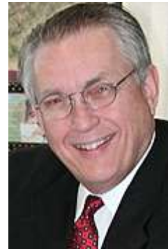
Executive Director BGCT Executive Board

Now, we are seeing many from Mexico and other nations come into Texas—both legally and illegally.