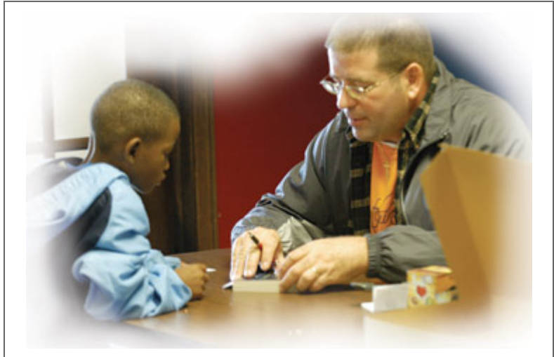
A CityChurch of Amarillo volunteer shares the gospel with a block party participant during CityReach, an evangelistic emphasis held in conjunction with the Baptist General Convention of Texas annual meeting.

That's the name of the Bible translation a volunteer from CityChurch of Amarillo gave him as he heard the Christian plan of salvation. The pair closed their eyes in prayer, and then they embraced in celebration of a new life in Christ.