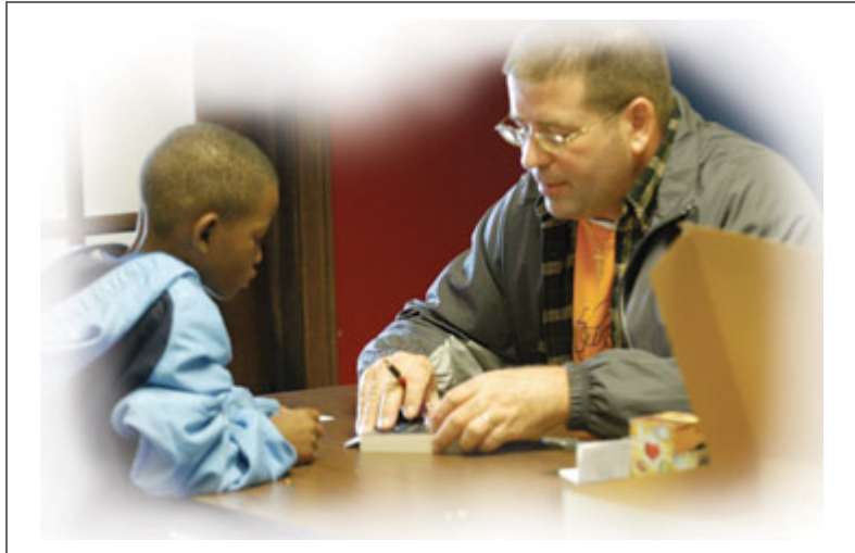
A CityChurch of Amarillo volunteer shares the gospel with a block party participant during CityReach, an evangelistic emphasis held in conjunction with the Baptist General Convention of Texas annual meeting.

That's the name of the Bible translation a volunteer from CityChurch of Amarillo gave him as he heard the Christian plan of salvation. The pair closed their eyes in prayer, and then they embraced in celebration of a new life in Christ.