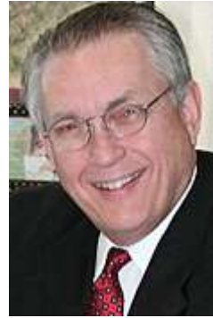
Executive Director BGCT Executive Board

were differences of opinion expressed, I trusted the words of my staff, as well as the affirmations of several in the Valley, and decided to go forward with our efforts.