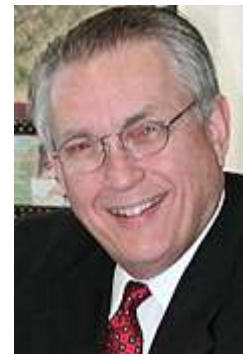
Executive Director BGCT Executive Board

Matthew 25 is a good example of how this happens. It illustrates several themes: The responsibility of being ready when great moments arrive, the responsibility of using what is trusted to you courageously, the responsibility of caring for the poorest among us, and the frightening consequences, in each case, when we fail to be responsible.