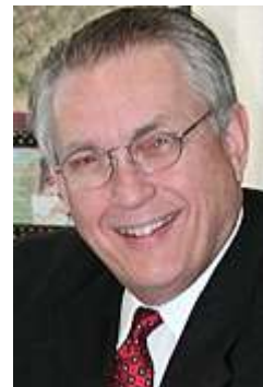
Executive Director BGCT Executive Board

Matthew 25 is a good example of how this happens. It illustrates several themes: The responsibility of being ready when great moments arrive, the responsibility of using what is trusted to you courageously, the responsibility of caring for the poorest among us, and the frightening consequences, in each case, when we fail to be responsible.