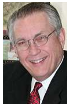
Executive Director BGCT Executive Board

A Christian always must begin from Scripture. When you do, you notice Jesus embraced and affirmed people who often were the most unloved in their communities—a Good Samaritan, the woman at the well, a blind beggar, Zaccheus the tax collector. He had an aversion to religious arrogance and hypocrisy but had an affinity for outcasts.