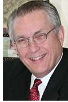
Executive Director BGCT Executive Board

Their assignment—to provide lay-led Bible study—helps the church do all its work more than any other ministry or organization I know.