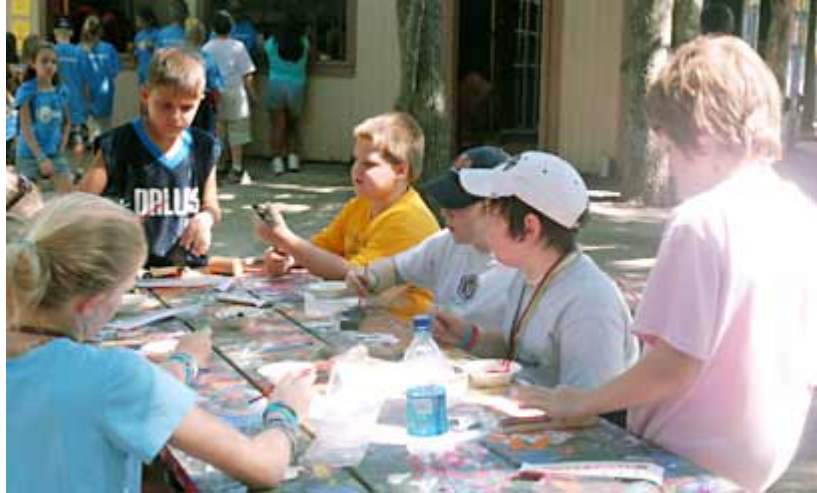
Campers paint diuring a crafts session.