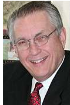
Executive Director BGCT Executive Board

Baptists are like those building friends. We come together, divvy up the work and go at it. Churches and conventions work both separately and together; and, in the end, we've built something special. Of course, we know that it is God building through us, but we surely are part of the work (1 Corinthians 3:9).