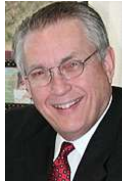
Executive Director BGCT Executive Board

Baptists are like those building friends. We come together, divvy up the work and go at it. Churches and conventions work both separately and together; and, in the end, we've built something special. Of course, we know that it is God building through us, but we surely are part of the work (1 Corinthians 3:9).