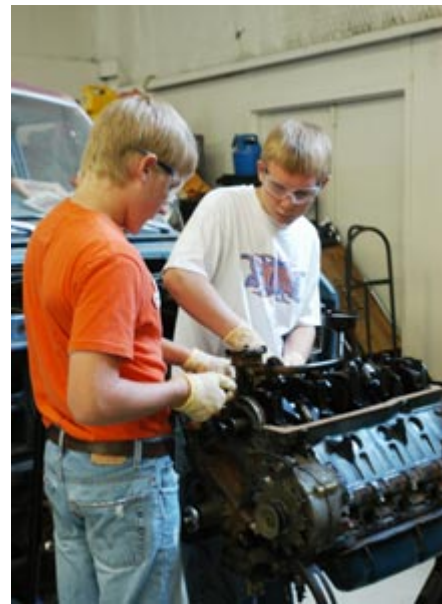
Auto Mission helps young men learn to rebuild car engines—and troubled lives.

With this in mind, Legan began Auto Mission as an outlet for troubled boys because “all teenage guys are interested in cars and girls, ... and I don’t know much about girls.”