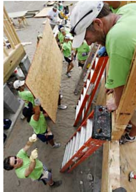
Teens from a youth group at First Baptist Church in Salado work on a Habitat for Humanity housing project in New Orleans.

This year, it's the site of the largest Habitat for Humanity project ever undertaken by a single denomination anywhere in the world.