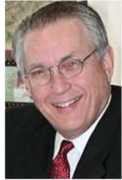
Executive Director BGCT Executive Board

The investigators found that there had been mismanagement on the part of a few of our staff and misuse and misappropriation of church starting funds on the part of a few pastors.