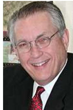
Executive Director BGCT Executive Board

This church also gave more money through the BGCT Cooperative Program last year than any other Texas Hispanic church—$31,220.