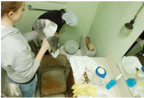
Two Cameron students clean the bathroom of a home damaged by smoke.