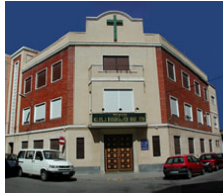
Texas Baptists built this church in Spain about 40 years ago.

DRIPPING SPRINGS—Participation in an international student exchange program provided Pastor Lonny Poe of Sunset Canyon Baptist Church with a real-life example of the effectiveness of worldwide Texas Baptist missions.