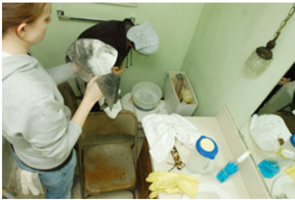
Two Cameron students clean the bathoom of a home damaged by smoke.