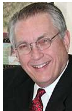
Executive Director BGCT Executive Board

Quite simply, Texas Baptists like being on the cutting edge of God's purposes in the world. I was reminded of that this past week. It was an emotional and intense time.